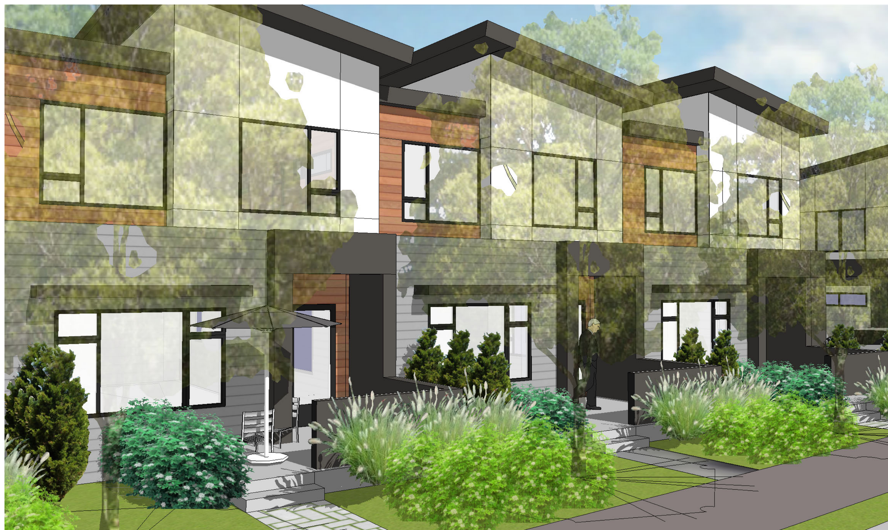
BUILDING 1 UNIT ENTRANCES FROM THE STREET