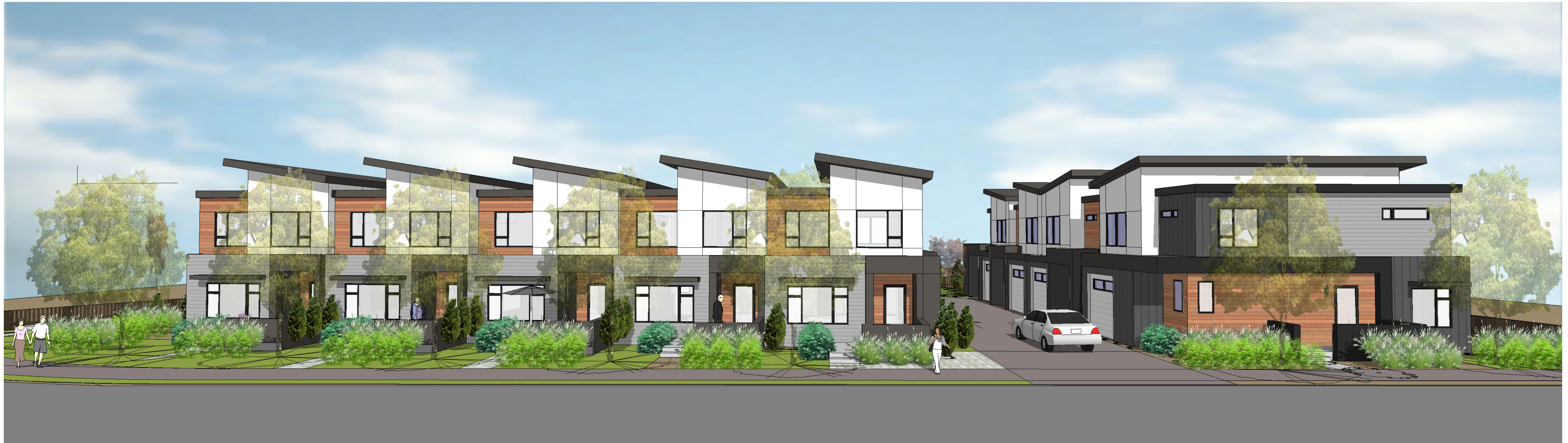
STREET VIEW FROM GODFREY ROAD