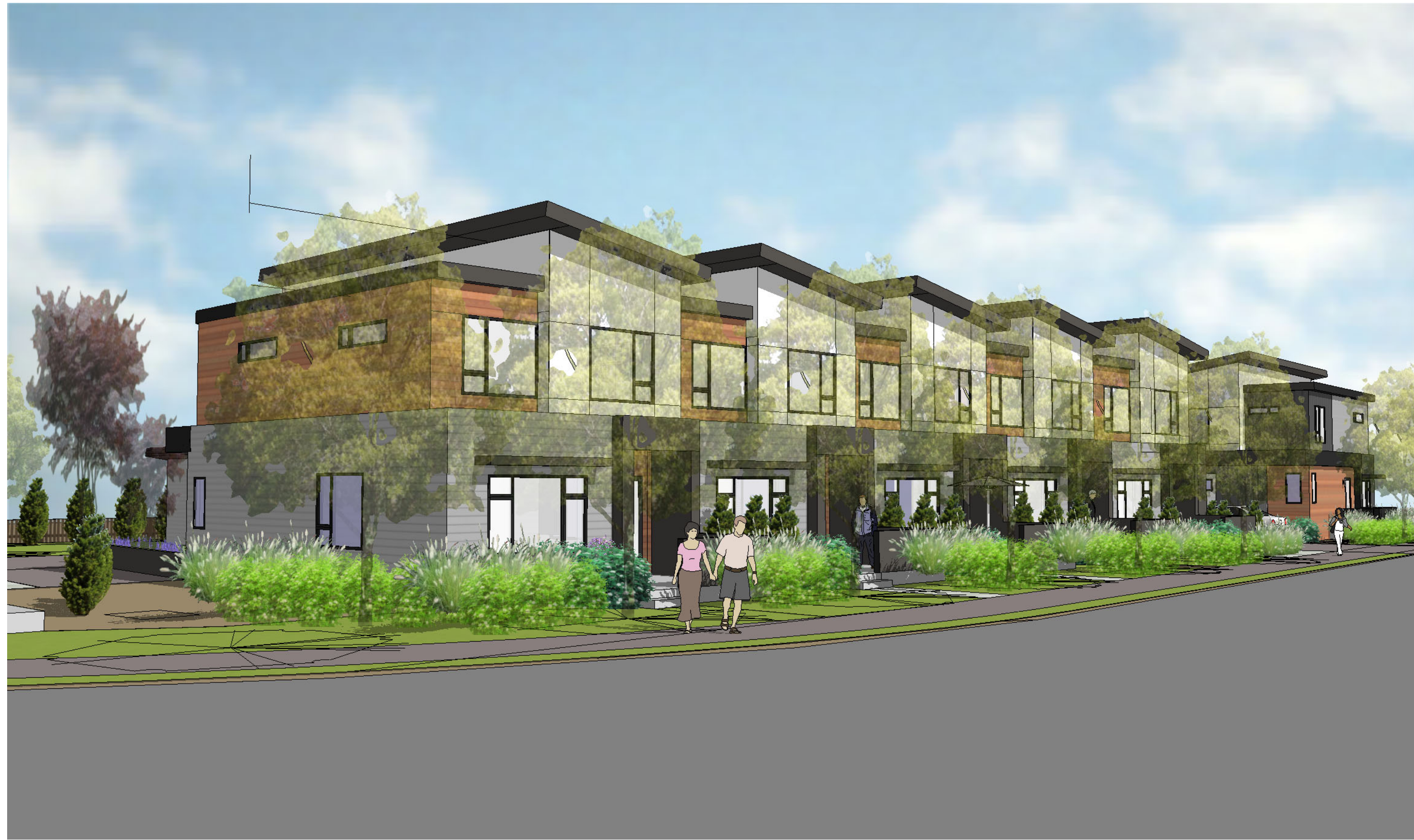
BUILDING 1 FROM GODFREY ROAD