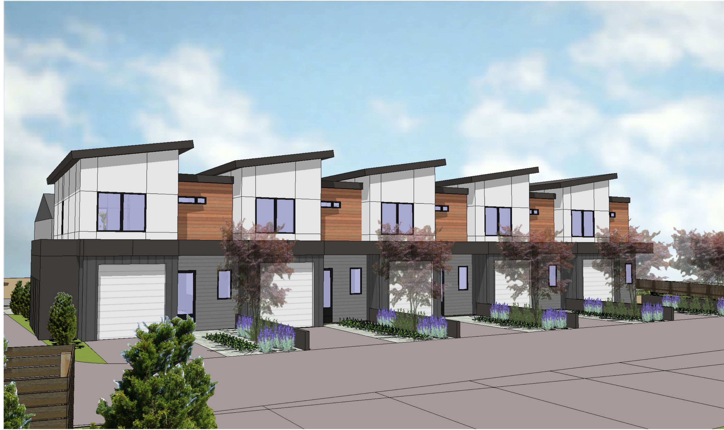
BUILDING 1 (REAR)