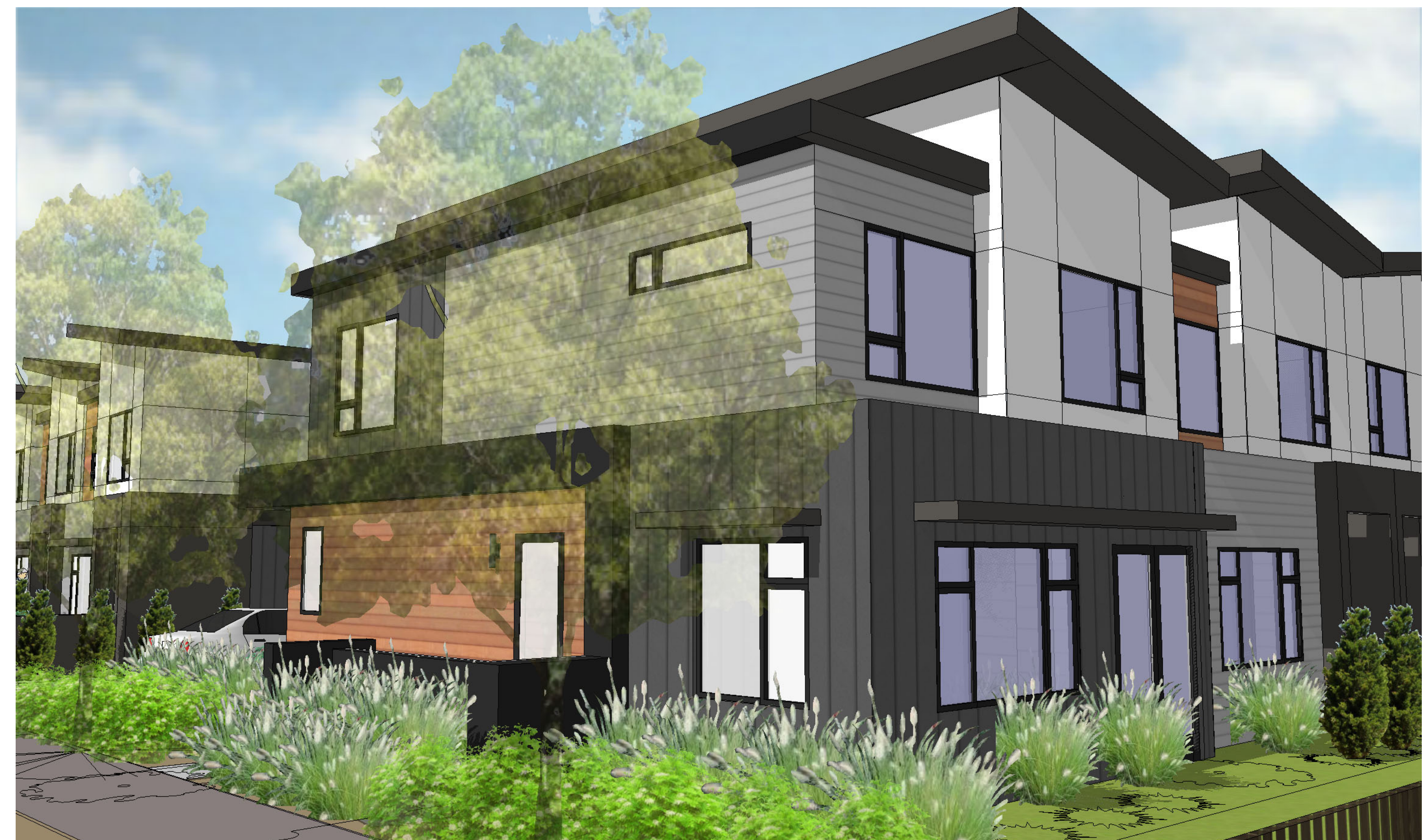
BUILDING 2 UNIT ENTRANCES FROM THE STREET