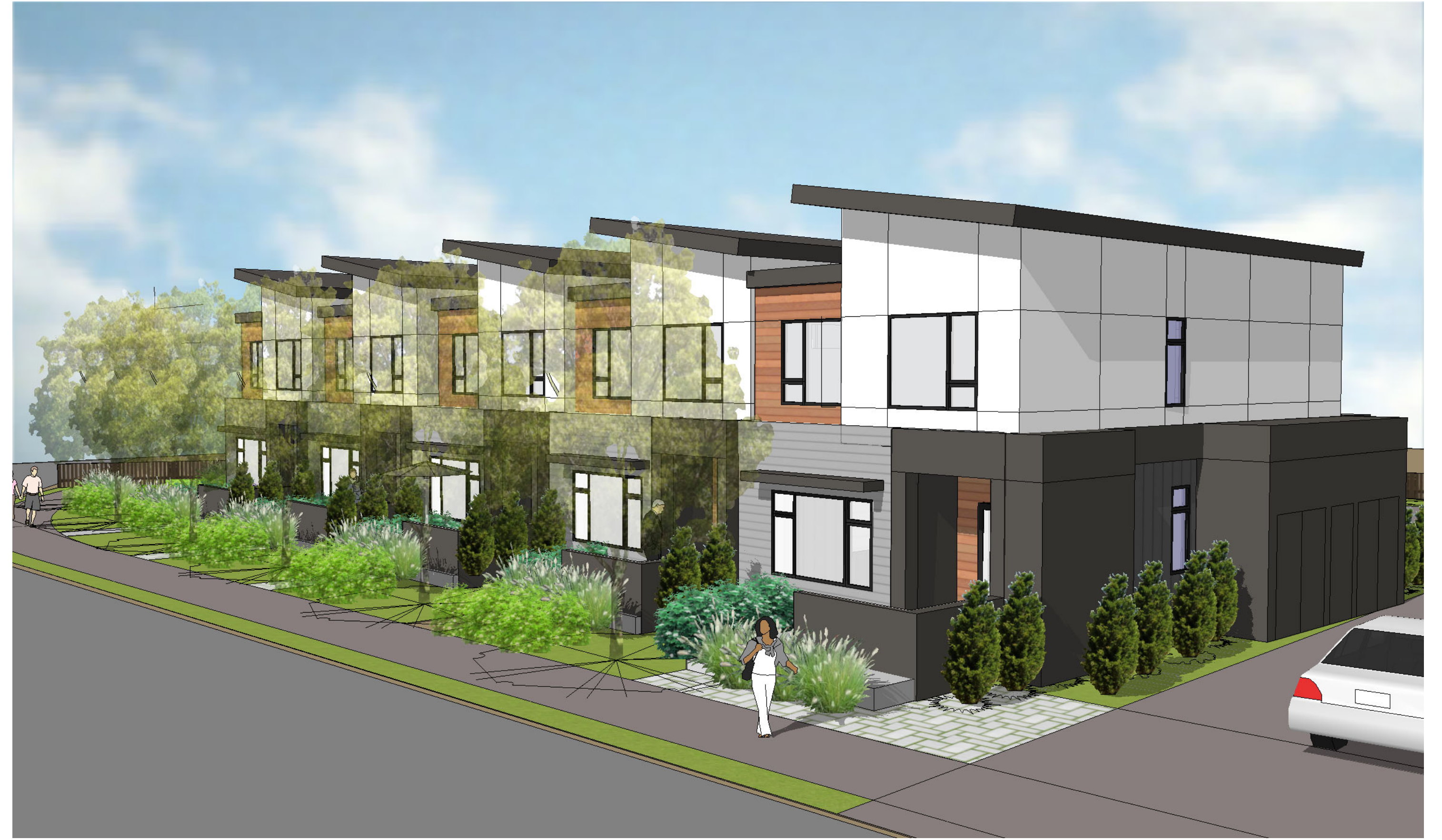
BUILDING 1 FRONT ENTRANCE FROM GODFREY ROAD